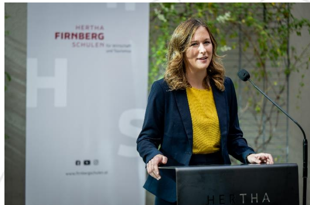
State secretary for youth Claudia Plakolm